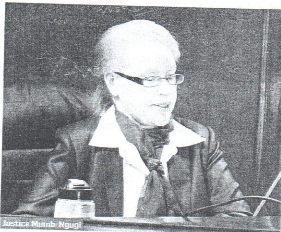
Justice Mumbi Ngugi